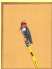
ACTUAL SIZE! On a pencil!

The Bee Hummingbird is the world's smallest bird.